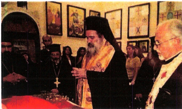
METROPOLITAN ATALLAH HANNA PRESIDING over the dedication of The Chapel of the Cross of Many Nations