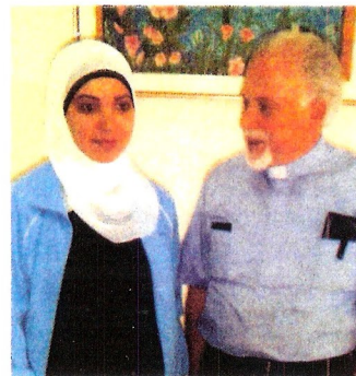
STUDENT FROM RAMOUN