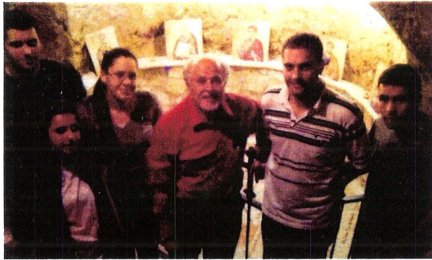
THE TAYBEH YOUTH COUNCIL AND FR. NASR inside the Grotto of the Twelve Apostles