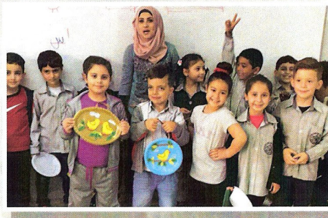
These students need our love and support