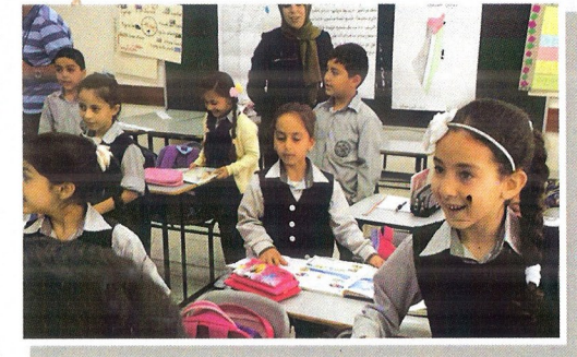
12 students received scholarships for their registration