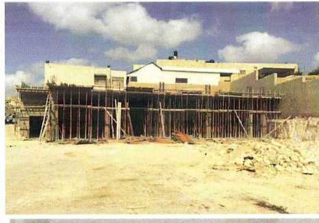
Construction of the new wing, 3 floors