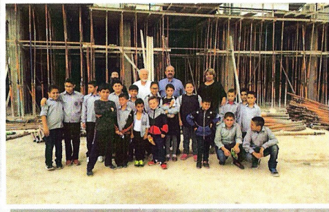
Shelter for the students during the summer and winter months